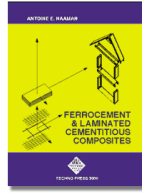
Ferrocement & Laminated Cementitious Composites

You can order one set of books simultaneously and take advantage of a 20% discount on each.